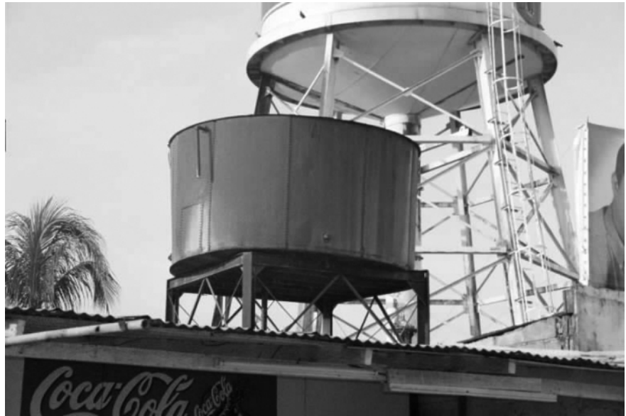
A water tower in Colonia Los Angeles. Residents use this small and unreliable water tower while nearby La Lima residents draw water from the larger water tower.

The project goal was to bring much cleaner water to 185 homes with about 1,200 residents in the community. When the Georgia Tech group arrived, the community asked them to help with three objectives — checking its pump, fixing the power and improving the distribution system. It was also using a very old and